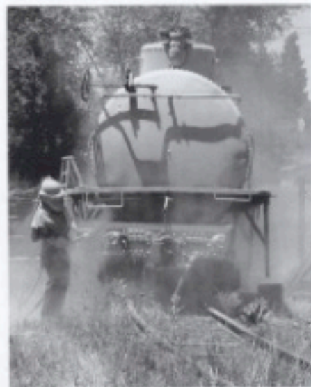
Clark Bradley is sandblasting the B end of UTLX tank car 12961. (Sandy Hogan)