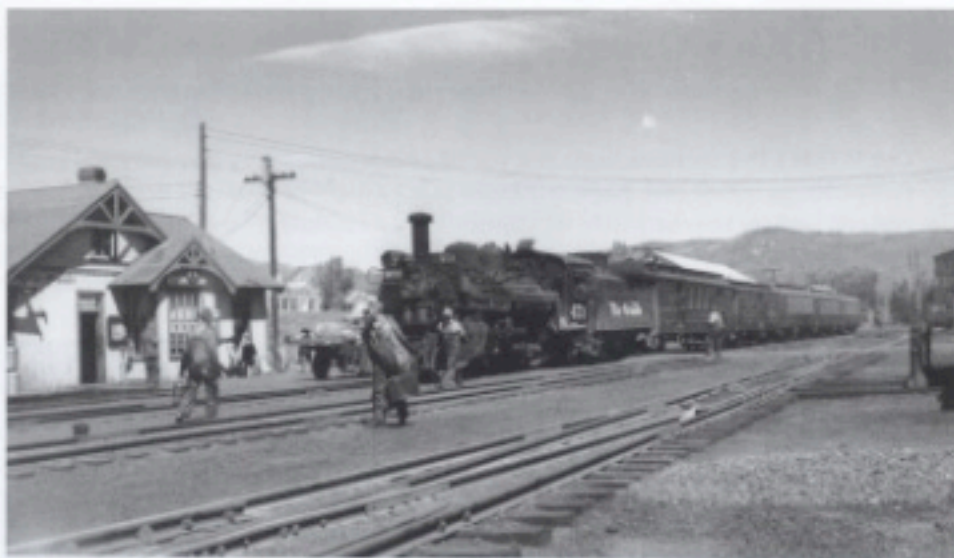
Train No. 115, the westbound San Juan, September 9, 1946. For a detailed analysis of the activity in this photograph see "What's Happening Here" on page 14.