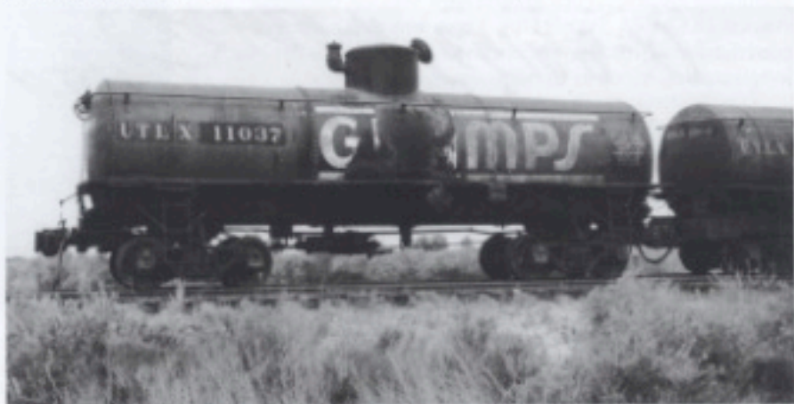
Gramps tank car, UTLX 11037, one of the frameless tank car bodies donated to the Friends. 3 July 1959, at Alamosa, Colorado.

Many of the UTLX cars converted to narrow gauge during the 1920s were the old narrow frame models. Another source of surplus tank cars for the narrow gauge was the original batch of frameless "V-cars" dating from the turn of the century. The design of these cars actually predates the cars having the narrow steel frames, however the frameless style still hadn't caught on with the railroads.