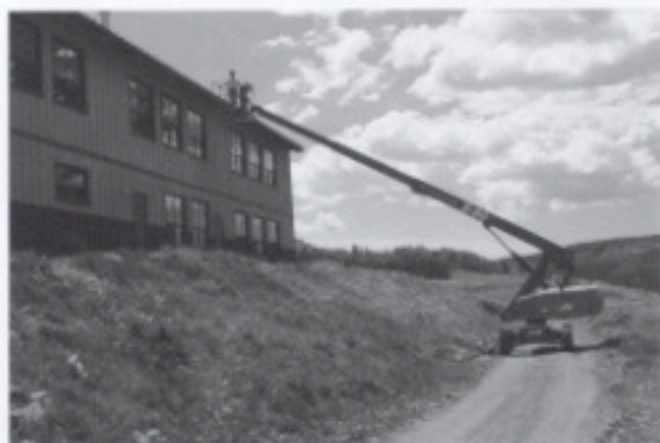
Clyde Putnam works from the self-propelled man-lift. With a 60-ft reach it allowed greatly improved access for painting the Osier Dining Hall. (Scott Hardy)

This year a self-propelled man-lift with a 60-ft reach was rented for the work. This was a great improvement over the use of the railroad's scissor lift and the trailer lift used in 2006. In 2006 most of the team's time was spent moving and blocking the lifts. By using the self-propelled lift this year, most of the team's time was spent doing actual work on the building rather than moving the equipment. This lift also allowed easy access for two people to virtually every location on the building (see photo).