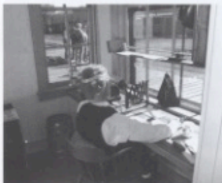
The telegraph office display in the Chama Depot as it appeared in late August, 2007. The mannequin illustrates dress typical of a telegrapher in the early 20 th century.

Significant progress was made on the Friends' interpretative projects during Sessions C and D. The first two of six panels were installed on the Kiosk at Cumbres. The Kiosk will provide visitors with historical information on the railroad, the activities that were required at Cumbres Pass, and the life of the people who lived and worked there. Progress was also made on the telegraph office display in the Chama Depot. It will illustrate the technology used by the railroad to communicate in the early 20 th century and explain the work of the telegrapher.