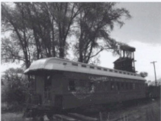
Hinman coach with new roof.