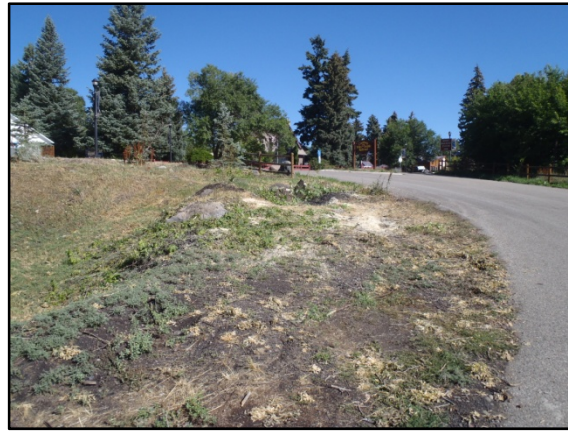
After tree was removed.

Session F: Took speeder from Chama north - cleared northern end of the Narrows, north of Lobato Trestle and Coxo area. Took speeder from Sublette to clear new growth and dead trees west of Rock tunnel, Mud Tunnel and Toltec area. Took Speeder from Sublette as far east as mile marker 294 clearing new growth and dead trees (mile markers: 306, 303 & 300). Northeast corner of Highway 17 first road crossing north of Chama. Cut down aspen. Southeast corner cut down cottonwood and aspen. This will give engineers a clearer view of the road for highway safety. Trimmed up trees on the yard by the carpenter shop. Helped put end sill on A end of RPO 54. Hauled 6 pick-up loads of debris to the swamp.