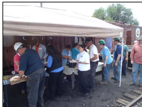
It has to be Thursday - hamburger day.