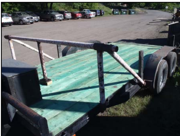
Repaired tool box and new floor was installed. Green.