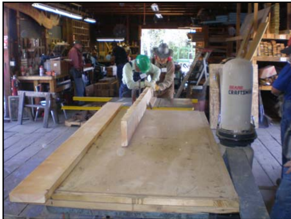
Making cut to make shiplap boards.

Made shiplap decking for OP. Took day and a half for three, part from the OP crew and part from the woodshop.