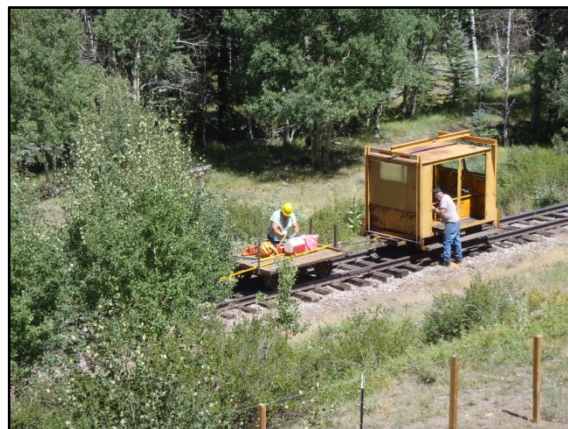
Trimming in "The Narrows".