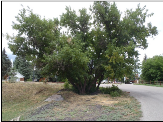
Tree at entrance to parking lot.

Work Accomplished: Session E: We cleared out The Narrows, north and south of Cresco water tank, several areas at Tanglefoot, mile marker 306 (Sublette). In the Chama yard we removed the tree at the entrance to the parking lot and the tree blocking the view of the log bunkhouse. We trimmed and cleaned trees on the west side of the parking lot. Cleared small trees around the round house, Friends' Support Cars and mechanic's shop.