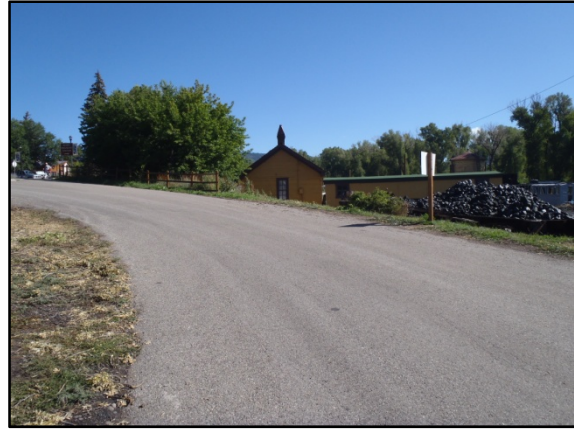
View of Log Bunkhouse exiting the parking lot after brush removal.

General Comments or complaints, if any. We recommend a larger crew to trim back to 2004 conditions.