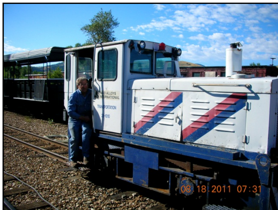
Art Randall working on a new air line for the Plymouth locomotive.

The Plymouth Locomotive air lines were reworked, so there is a single brake air line valve, train air was installed on the rear end so proper train operations are possible. We corrected the train coupler, mounting it on the rear of the locomotive. The locomotive was reversed so if train operations are desired, the locomotive needs only to be run past the switch, and backed to the passenger cars to be properly hooked up.