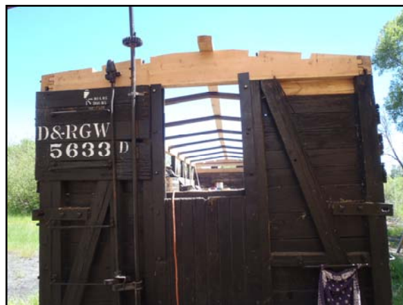
Roof beams have been installed on both ends of Sheep car 5633.

Helped plane and mortise the end roof beams for the sheep car.