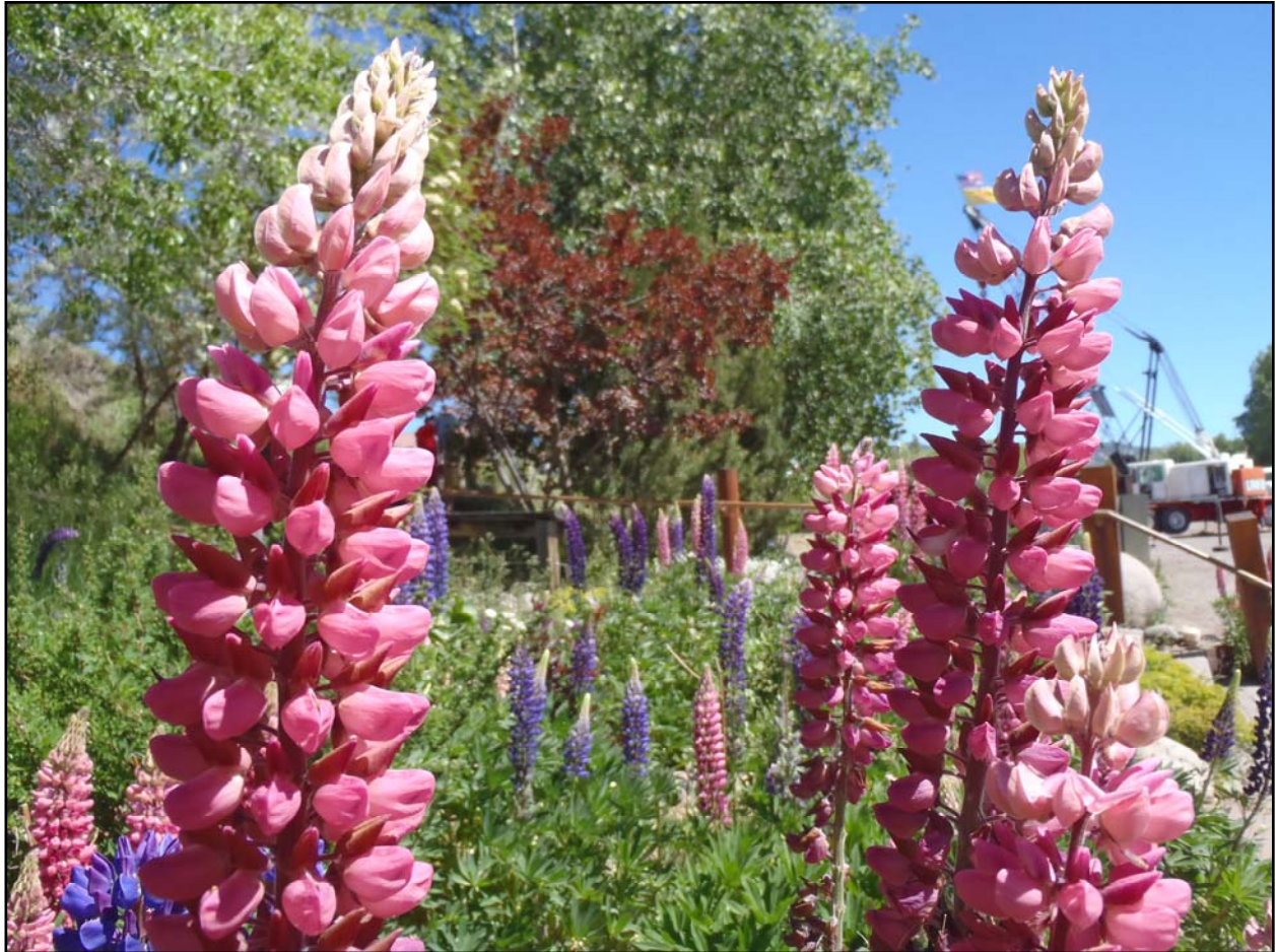
Flowers in "Alta's Garden"

Turn on soakers in Alta's Garden at faucet on the west side of the station. It's the green hose. (the faucet the buses use for washing their buses.)