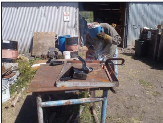
Marshall welding up the Band Saw Base.

In general, each session requires similar activities in the bolt car. Many special bolts were needed, u-bolts, hangers, were fabricated. Assisted with selection of proper fasteners by team members, re-inventoried returned fasteners, ordered addition inventory, rethreaded bolts, supplied miscellaneous hardware, and disassembled used hardware and fasteners to return to inventory. During the off season, the inventory will be updated and replacement fasteners ordered. In spring, team leaders should submit specific fastener orders for the 2012 work session.