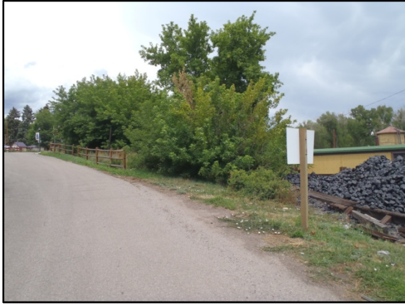
No view of Log Bunkhouse exiting the parking lot.