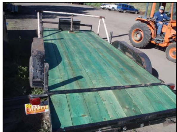
New floor was painted "Bettalico"