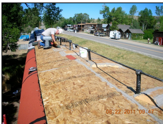
Tarry Rahne installing a false roof on A-3 Note treatment of the roof vents completely covered.