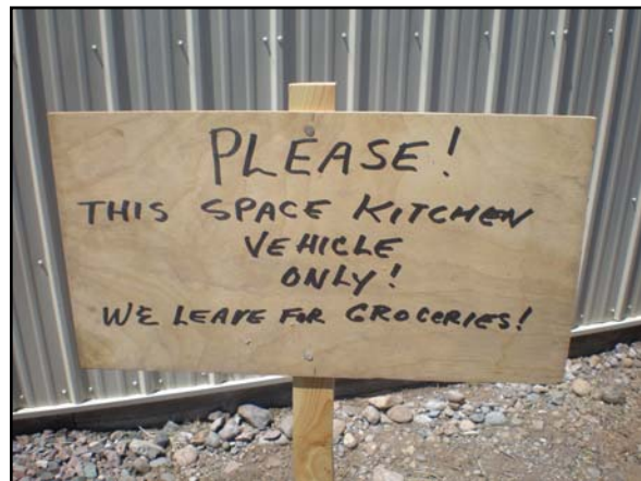
This temporary sign was intended to cut down on the distance groceries had to be hauled.

During Session A: Lunches, snacks and drinks were prepared for 39 volunteers in Antonito. Meals included Pastrami and Provolone, roast beef and pepper jack cheese, ham and swiss cheese, turkey breast and cheddar cheese. On Thursday the kitchen team prepared pull pork on hamburger buns and hosted eight railroad employees, two from the commission office and two from the Conejos County Road Office.