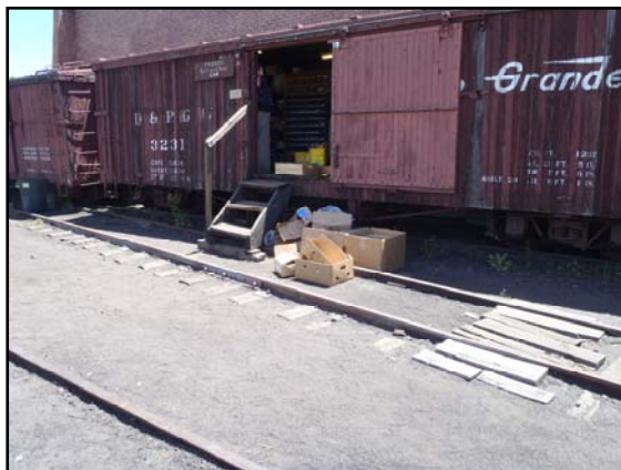
Empty boxes of shipment of replacement supplies for nut and bolt car.