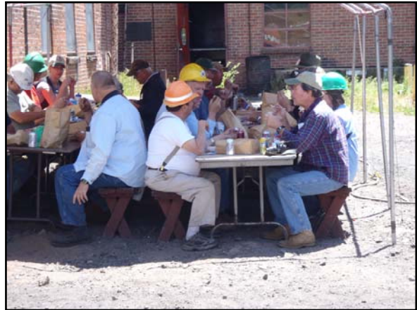
The most popular time of any work session - lunch time.

During Session D, Chama: Lunches were prepared in Chama for 44 volunteers (including 2 Mile Post crew and 4 Lava Pump house crew). Lunches included Black Forest Ham and Cheddar Cheese, Teriyaki Glaze Chicken and Swiss Cheese, Deli Sandwich and on Thursday a Hamburger Cookout (grilled by Jeanne Reib). The railroad shop crew, office staff and train crew also enjoyed burgers.