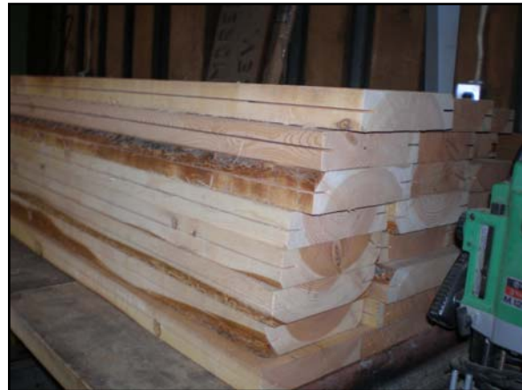
Shiplap boards with cuts on both sides.